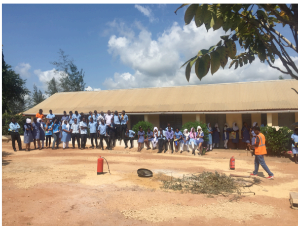
Fire training students

We are always on the look out to offer extra courses for our students and staff, as part of staff development. This year we focused on our permaculture courses for most of the staff and also students. We always do our Red Cross 1 st Aid course annually and this year, we recently sent our ICT Officer in charge of DHIS2 tracker to a large medical conference in Liverpool, UK. We have offered sewing courses to some staff members and also offered a computer training package to our staff.