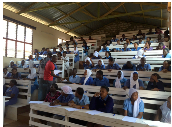
First Aid training by Red Cross